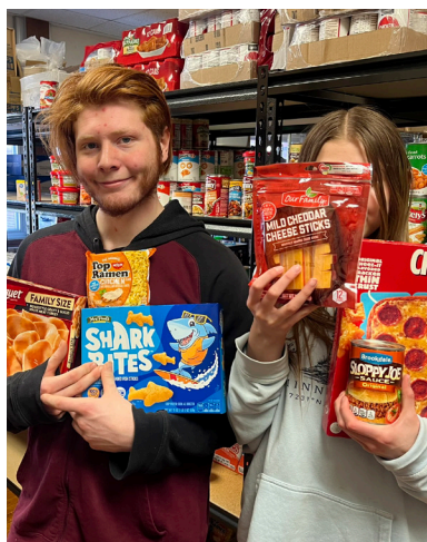
Food Pantry Volunteers At Dakota