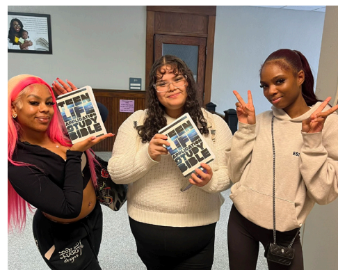
Students I Mentor From Dakota