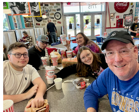
Our team on our trip to the YFC National Leadership Conference

On February 12th, we participated in Giving Hearts Day, one of the largest fundraising days of the year for nonprofits in North Dakota and northwest Minnesota. Every gift of $10 or more up to $26,300 was matched, multiplying the impact of each donation. In addition to fundraising, our team prepared and delivered meals to schools, community partners, and local businesses as a way of expressing appreciation and strengthening relationships. I was unfortunately out sick with the flu that week and couldn't be there that day, but I helped in the weeks leading up to the event and afterward by writing thank-you letters and making personal phone calls. By the end of the day, we raised $65,706 . Our big, God-sized goal was $80,000. While we didn't quite reach it, we saw incredible generosity and God's faithfulness on display. This support allows us to continue showing up consistently for student's week after week.