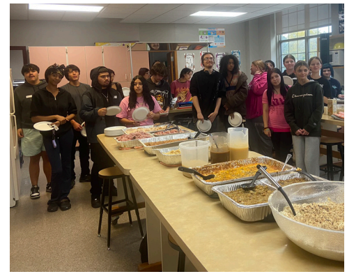
Dakota Cooking Club Thanksgiving Edition