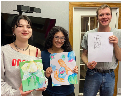
A few of our first art night artists and creations.

Finally, at the Alternative Learning Center, we like to do things called "Story time," where a staff member will sit down and be interviewed by another. The staff member will talk about their life story and what brought them to the Lord. It's been so cool to see all the teens flock around a staff member after they share either questions or encouraging words. This has made me realize something quite valuable: they not only want to share how they feel, but they also want you to share as well!