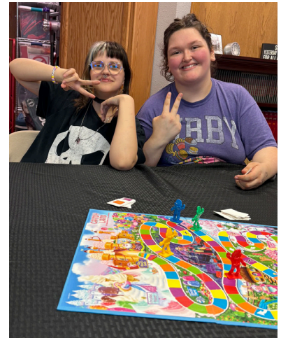
Game Night Candy Land. Who knew it could be so much fun?!

Many different life changes have happened. Around Christmas break, it was decided by the YFC Team and I that I should cut back to part-time due to being in school 20+ hours a week and trying to work full-time. Soon after Christmas break, God was showing me many different things about my life, including my character. After much prayer and counsel, I decided it would be best to take a break from Bible College to focus more on my relationship with God and be more independent. I found I cared more about my GPA than my quality time with God, which impacted my spiritual life. With all my new free time later on, I decided to pick up a part-time job in the hotel business. This part-time job was selected as it does not overlap with Youth for Christ.