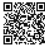
More About RRYC