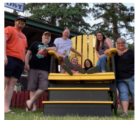
Summer staff retreat brings you this awkward photo of our team.