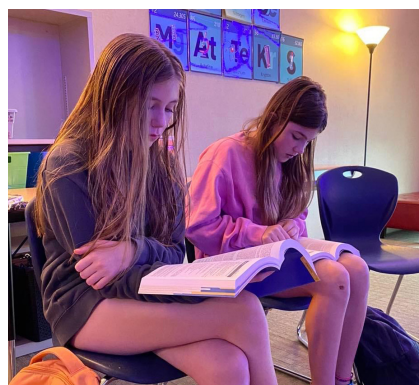
YFC/FCA Bible Study at Liberty