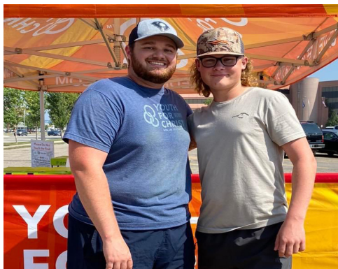
A previous Liberty student & mente visiting our peach stand this summer.

With summer fruit sales being over, this means that ministry life is back in the full swing of things! I am going to be continuing going to Dakota alternative school on Tuesday's to play basketball with the students. As a team we are also going on Wednesday's to serve a community lunch, and I also play basketball with the students once that is over. I am currently in the Detention center a couple times a week. I have a Monday Bible study/hangout time with the kids, and we will also be having "Church" for the kids on Wednesday nights. There have been multiple kids asking for one-on-one opportunities due to the Monday night gathering. This has led to many deeper conversations, and even one resident making contact when he got out! After weeks had gone by of silence I had just assumed just like others, promises were made but once out those promises didn't seem appealing. We will be at Liberty middle school for the second year now. Last year brought a lot of newness and challenges as we tried to navigate where God was leading us. After a few meetings with the school we have decided