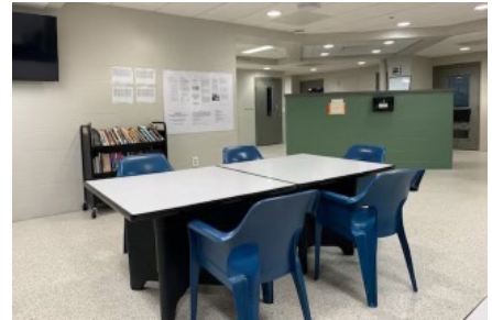
West Central Regional Juvenile Center Pod