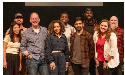
Concert for a Cause 2023

Have a very Merry Christmas and a Happy New Year!