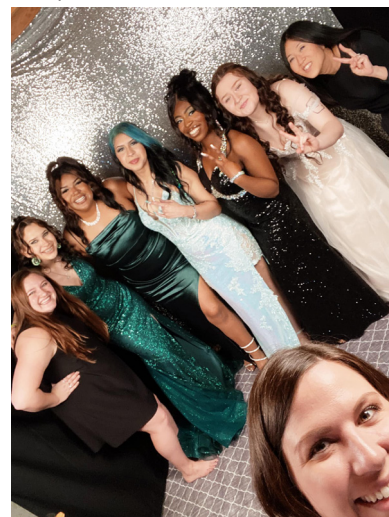
YFC team & the prom dinner crew