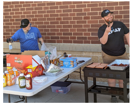
Project Serve at Liberty