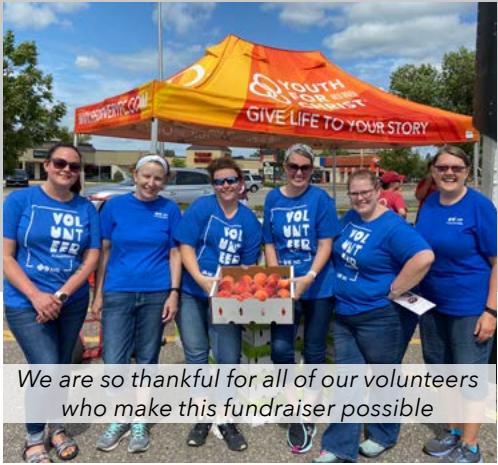
We are so thankful for all of our volunteers who make this fundraiser possible