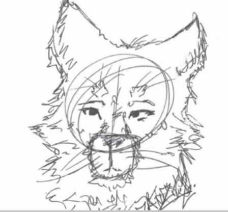
A Fox sketch by one of our youth freinds