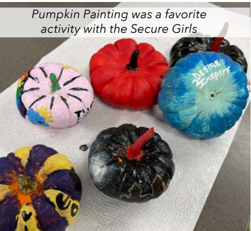
Pumpkin Painting was a favorite activity with the Secure Girls