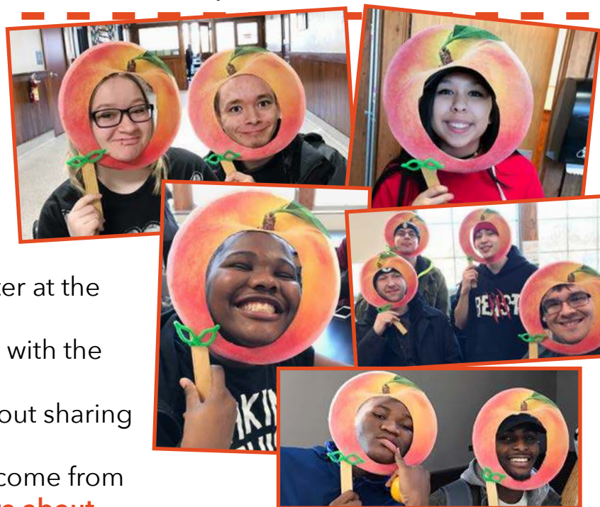
From the students at Woodrow Wilson HS, thank you for supporting RRYFC on Giving Hearts Day!

Thank you for supporting our ministry. Together we can radically love and bring hope to teens in the Fargo-Moorhead community!