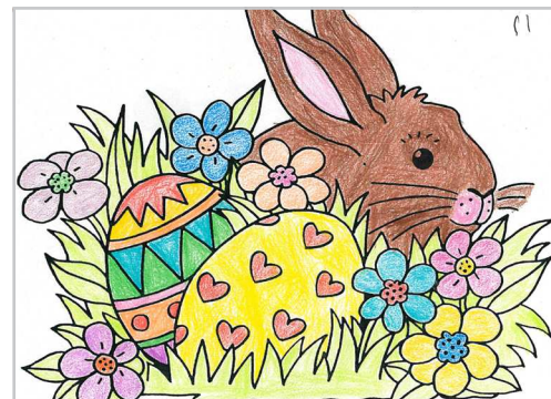
Coloring by a young friend at West Central

Are you looking for a way to really make an impact? Youth for Christ has some amazing opportunities for ministry here in the Fargo area. We are looking for people who feel called to be missionaries to the student community we work with. For more information check out our website under "Get Involved" and "Employment Opportunities" or www.redriveryfc.com/get_involved/employment_opportunities/ . If you know of someone who might be a perfect fit for us please share this with them!