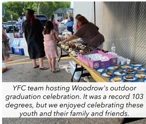
YFC team hosting Woodrow's outdoor graduation celebration. It was a record 103 degrees, but we enjoyed celebrating these youth and their family and friends.