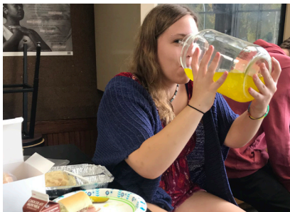
Thank you to those that helped provide & serve meals this year. The kids loved it & not even the pickle juice was wasted!