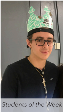
Students of the Week