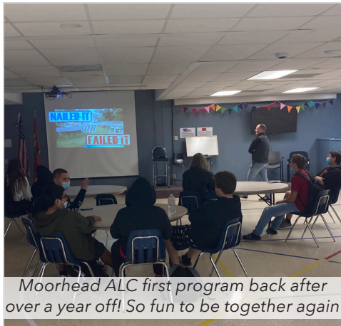
Moorhead ALC first program back after over a year off! So fun to be together again