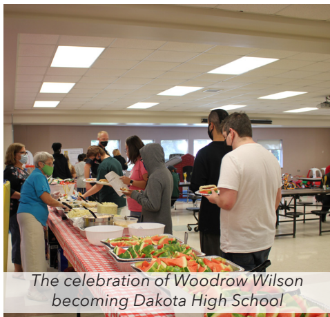
The celebration of Woodrow Wilson becoming Dakota High School