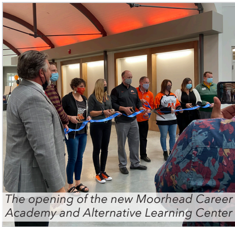
The opening of the new Moorhead Career Academy and Alternative Learning Center