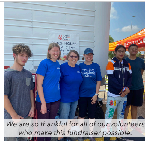
We are so thankful for all of our volunteers who make this fundraiser possible.

Thank you to everyone who bought our fruit this summer and all of our wonderful partners Magnum, Scheels Home & Hardware, Bell Bank, Black Bear Orchards, Martin Family Orchards, and Genuine Georgia. Also, Special thanks to Blue Cross Blue Shield of North Dakota and to all of our amazing volunteers. We are so thankful for you all!